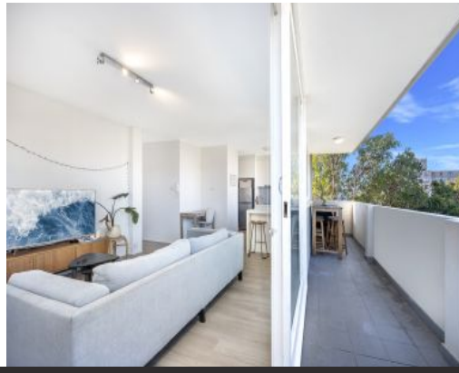
9/314 Bondi Road BONDI, NSW