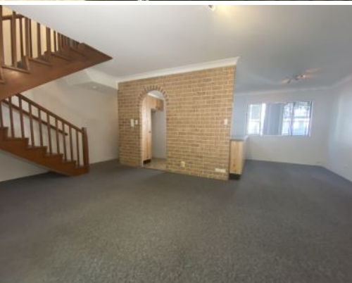
3/19 Cook St RANDWICK, NSW