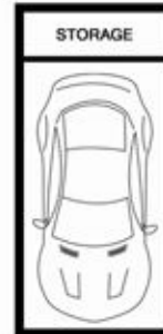
SECURE CAR SPACE APPROX. FLOOR AREA 16.0 SQ.M.