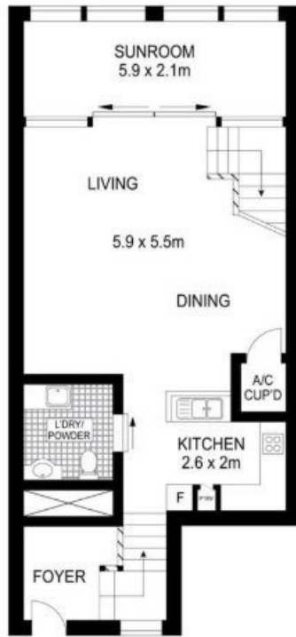
ENTRY LEVEL FIVE